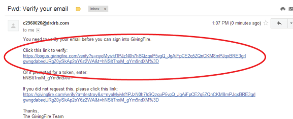
The verification email (with link highlighted)